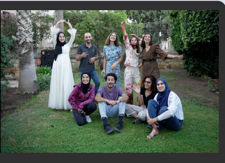
Performance & Public Spaces Workshop

I'm so excited to continue working with you, please reach out to learn more.